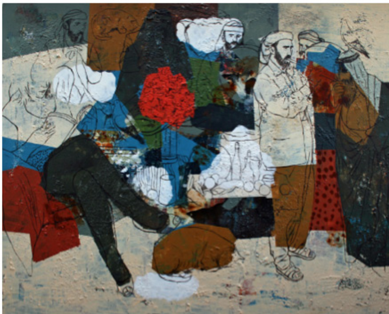
Hilos de Luz n° 17, Hanoos Hanoos

Threads of Light - Hanoos Hanoos Al Mutanabbi Street Starts Here - Various Artists 17 January - 21 February 2014 Private View: Thursday 16 January, 6.30-8.30pm Exhibition Open: Tues-Sat, 11am-6pm, FREE The Mosaic Rooms, 226 Cromwell Road, London SW5 0SW