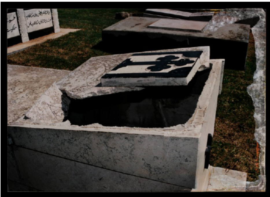
40 DAYS, Scanogram, archival inkjet print, 93 X 65 cm, 2012

The Mosaic Rooms, 226 Cromwell Road, London, SW5 0SW