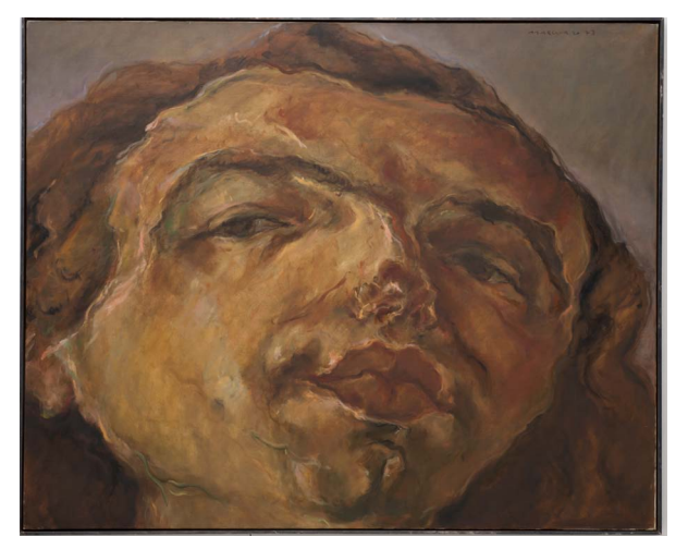
Untitled, oil on canvas, 156cm x 195cm, 1973

Not towards home, but the horizon Marwan 9 October - 28 November 2015 Private View: Thursday 8 October, 6.30pm-8.30pm Exhibition Open: Tues-Sat, 11am-6pm, FREE The Mosaic Rooms, 226 Cromwell Road, London SW5 0SW