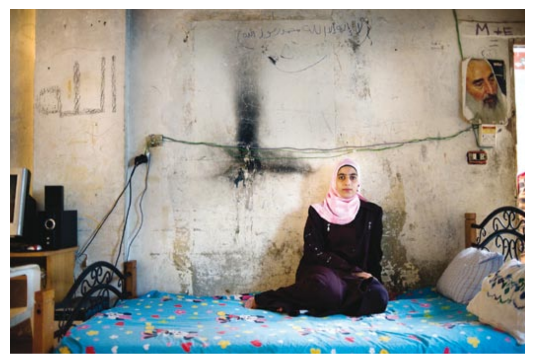
Elham 18 - Shatila, Beirut. Archival pigment print, 2010. 71cm x 107 cm