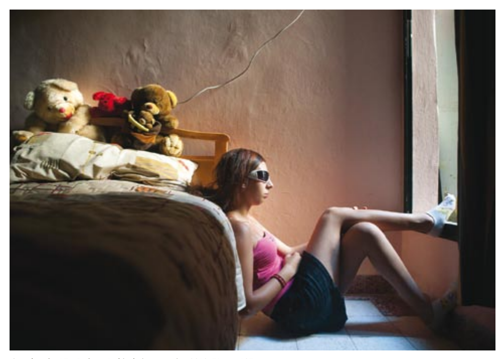
Stephanie 15 - Beirut. Archival pigment print, 2010. 71cm x 107 cm