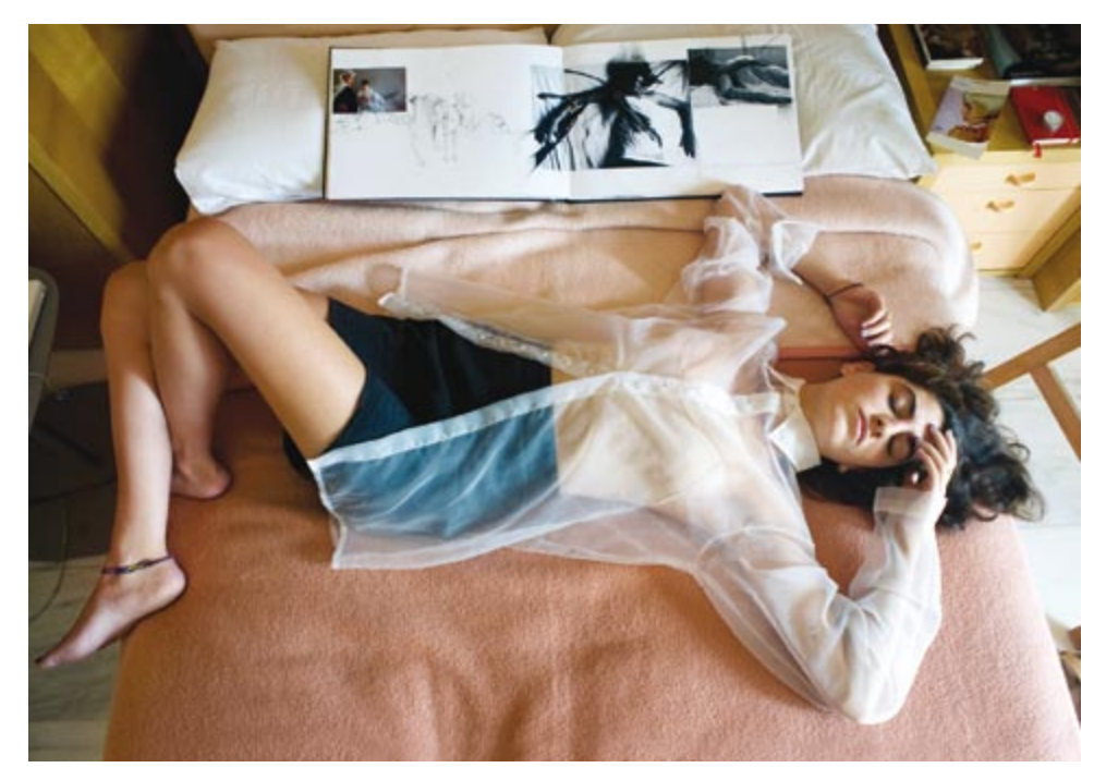
Reem 19 - Lebanon. Archival pigment print, 2010. 71cm x 107 cm