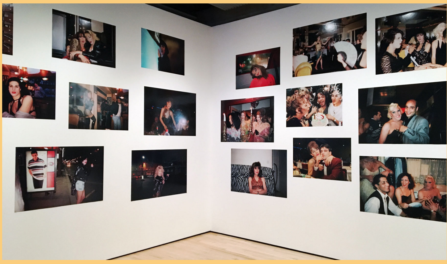
Kader Attia, The Landing Strip, 2000–2002